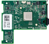
ConnectX3 QDR (SFF)

Combine the M4001Q with Mellanox ConnectX3 or ConnectX2 QDR InfiniBand Mezzanine Cards for end-to-end 40Gbps.